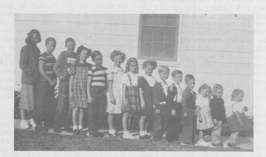
ALL THE CHILDREN IN THE DAVIS HOME

The Davis Home for Children is indeed a worthy work and merits your interests and support. The mailing address of the home is Route 2, Box 70, Madera, California.