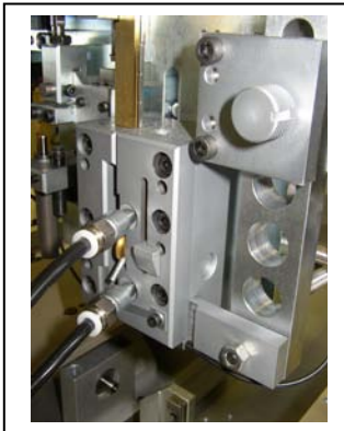
PLT-901 CXP Toolset