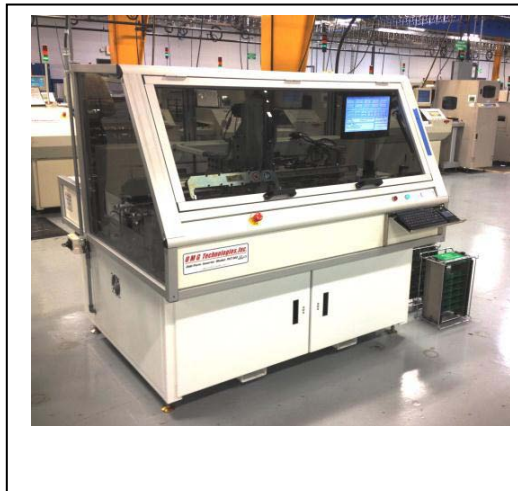
Photo: PLT-901 Inline System with Single CXP Head