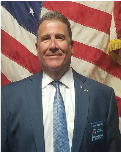
Brothers and Sisters,