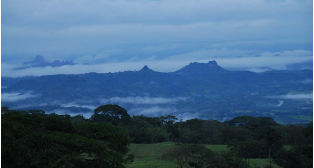
Dawn view across Magdalena Valley from La Victoria ridge

Highlights of the remainder of our morning's birding included finally tracking down endemic Sooty Ant-Tanagers (after hearing them calling regularly we had repeatedly struggled to actually see any until they finally arrived in large groups!), a strikingly coloured Orange-billed Sparrow and Buff-rumped Warblers foraging through the leaf-litter and under-story. Clearly La Victoria would justify more time birding - maybe two nights giving two full mornings? - but with a seven hour drive ahead of us on our way to Rogitama via Bogotá we reluctantly had to leave, grab lunch (2 large roast chicken meals for about US$6 at the best restaurant in town), check out of the hotel (2 simple but clean rooms for a total of about US$12) and head off in a steady rain that continued all afternoon and evening.