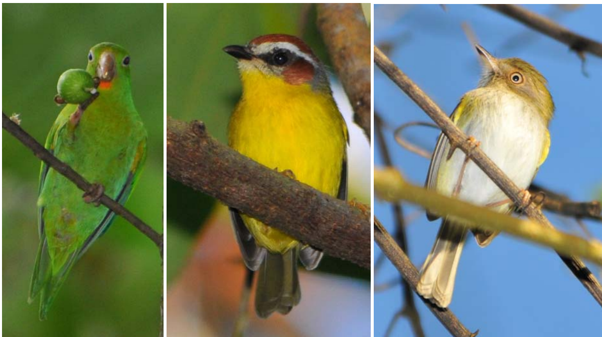
Orange-chinned Parakeet (Minca); Rufous-crowned Warbler (Minca); Pale-Eyed Pygmy Tyrant (Minca)

The birding concluded with a personal total for the entire trip of some 247 confirmed species, including 61 “first time ever” species. Of these, 25 are Colombian endemics and several others are found only in Colombia plus Venezuelan border regions.