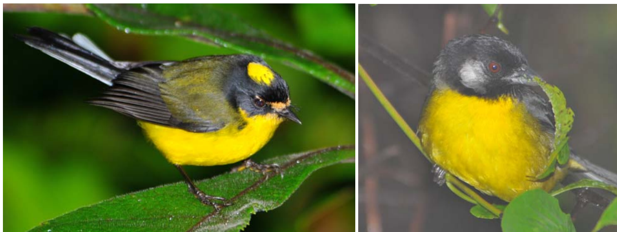
Yellow-crowned Redstart; Santa Marta Brush-Finch (both Sierra Nevada de Santa Marta)

there had been zero traffic on the road that morning (usually there are a couple of vehicles taking supplies to the military base and communications towers at the top of the ridge) and speculated that maybe access to our road had also been affected by the heavy rains. This proved to be all too true, because as we made our way down the mountain road to our next planned hotel at the base of the mountain, a motorcyclist informed us that a huge landslide had blocked the only exit road and that it was unlikely to be opened 'for a day or two'! Since we had already descended some considerable distance but could not reach our planned hotel below the landslide, the ProAves staff was kind enough to invite us to stay at their very comfortable lodge and even provided the three of us with dinner and breakfast. Many thanks are due to Waly for arranging this and to ProAves for being so accommodating under these exceptional circumstances.