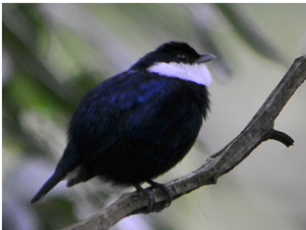
Striped Manakin (La Victoria); White-bibbed Manakin (La Victoria);