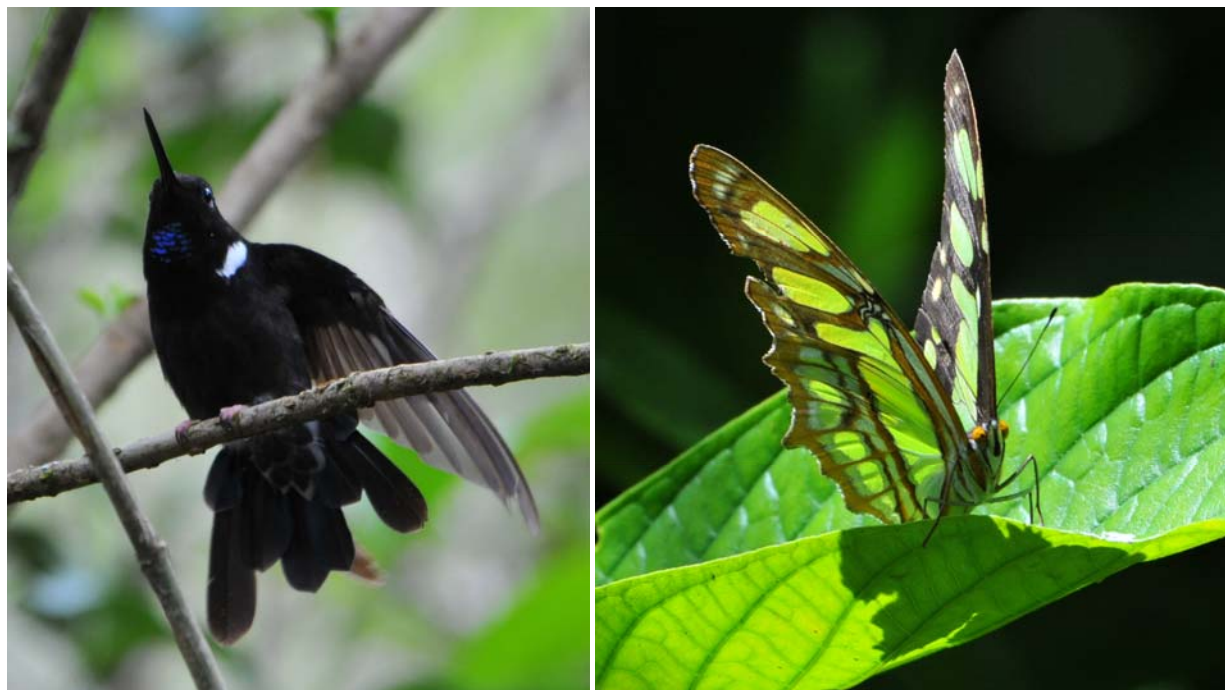
Black Inca (Rogitama); Butterfly (Soatá)

Diego and I spent our final morning birding Alto de Onzaga, a wonderful roble (oak) forest located immediately above Soatá at between 2800 and 3050m altitude. This forest is home to the endemic Mountain Grackle and we were treated to wonderful views of their discrete chestnut wing-tufts as a large flock of 20+ individuals moved noisily up the valley and then fed in the trees close to our vantage point. Our excellent morning continued with Red-crested Cotinga, a glamorous male Longuemare's Sunangel and several mixed flocks full of woodcreepers, woodpeckers and tanagers - including stunning Red-hooded Tanagers that perched up in the trees to give us a wonderful view of this uncommon bright red, yellow and green species. Not bad for the final new bird on this short but highly productive trip with Diego! Of the sites we visited together my favourites were the Alto de Onzaga roble forest above Soatá and the forested ridge above La Victoria, both of which offer access to interesting endemics in a spectacular setting.