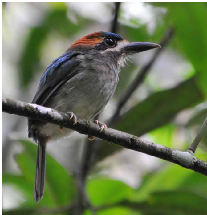
Tody Motmot (La Victoria)