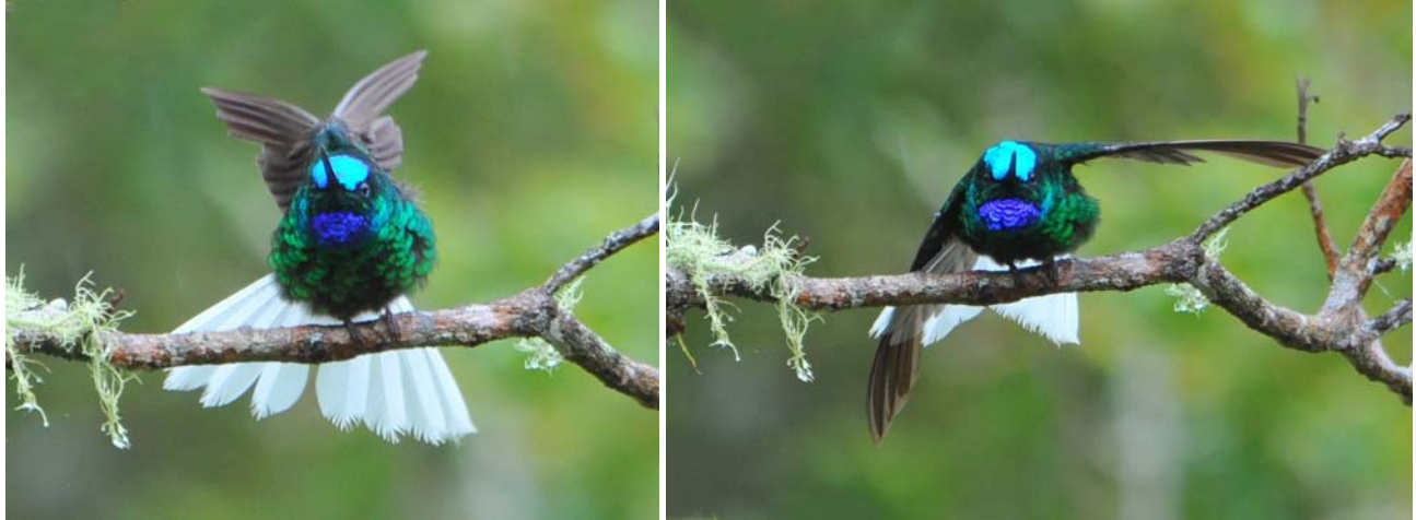
White-tailed Starfrontlet (Sierra Nevada de Santa Marta)

On our second day, the weather was more cooperative (nothing more than intermittent drizzle!) and we spent the morning hiking up the road to ca. 2500m and then back down to the ranger station. In addition to the endemic species previously seen we added Santa Marta Emerald Toucanet [seen several times], Santa Marta Parakeet [heard occasionally and only seen flying], Santa Marta Bush-Tyrant [at upper elevations only], Santa Marta Tapaculo [heard frequently and seen once] and - just to break the nomenclature trend - a Brown-rumped Tapaculo [heard frequently and seen once]. Apart from the ubiquitous white-throated Tyrannulet, almost everything we saw was endemic! Mid-morning, Emma discovered another endemic hummingbird - the glamorous White-tailed Starfrontlet - that we were able to photograph in reasonable light, plus a male Tyrian Metaltail that we initially miss-identified (to our excitement) as an endemic and uncommon Black-backed Thornbill.