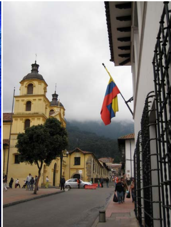
Underground Salt Mine Cathedral (Zipaquirá, near to Bogotá); Downtown Colonial District (Bogotá)