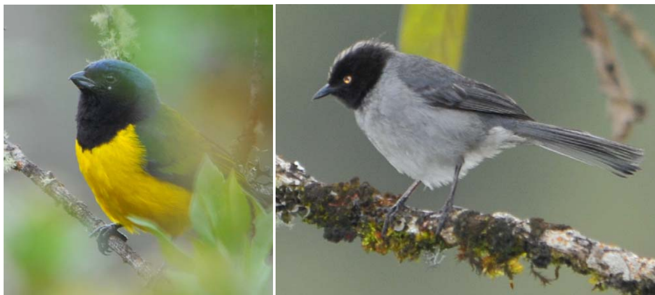
Black-chested Mountain-Tanager (PNN Chingaza); Black-headed Hemispingus (PNN Chingaza)

My first birding with Diego was a day trip to the high altitude, tree-line forest and páramo near to the Parque Nacional Natural (PNN) Chingaza at an altitude of some 3200 - 3500m, about 1 hours drive from Bogotá. This area in the Eastern Andes contains several species that are also found in the Venezuelan border areas of Táchira State and the Perijá mountains of Zulia State. Having never visited those parts of Venezuela I was keen to see these regional endemics and very quickly we had good views of specialties such as Rufous-browed Conebill, Golden-fronted Redstart (both quite common) and a male Glowing Puffleg. Flowerpiercers were common-place (Glossy, Black and Masked) and one memorable mixed flock included attractive Black-chested Mountain-Tanager, Scarlet-bellied Mountain-Tanager, plus Black-headed and Superciliaried Hemispingus, whilst a confiding Crowned Chat-Tyrant was a nice surprise amongst the more common Brown-backed Chat-Tyrants. After failing to entice various tapaculos and antpittas into view we finally got lucky with close-up views of a Rufous Antpitta calling from a tangled thicket.