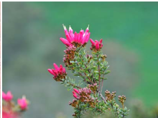
Colourful Moss (Sierra Nevada de Santa Marta); Flowering Bush (PNN Chingaza)