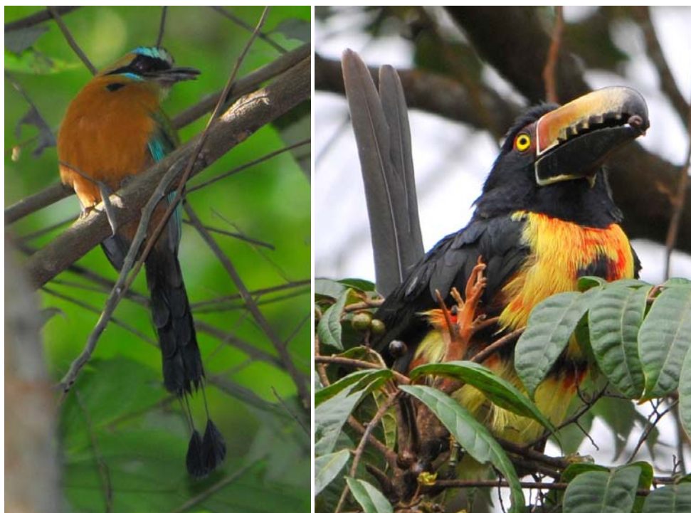
Blue-crowned Motmot (Minca); Collared Araçari (above Minca)