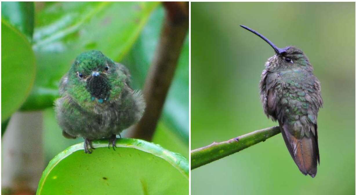
Tyrian Metaltail; Immature Mountain Velvetbreast (both Sierra Nevada de Santa Marta)

On the road we met another group of birders and their guides who were based in the ProAves lodge at their El Dorado reserve, some 5km down the road from the ranger station at ca. 1800m altitude. We all noted that