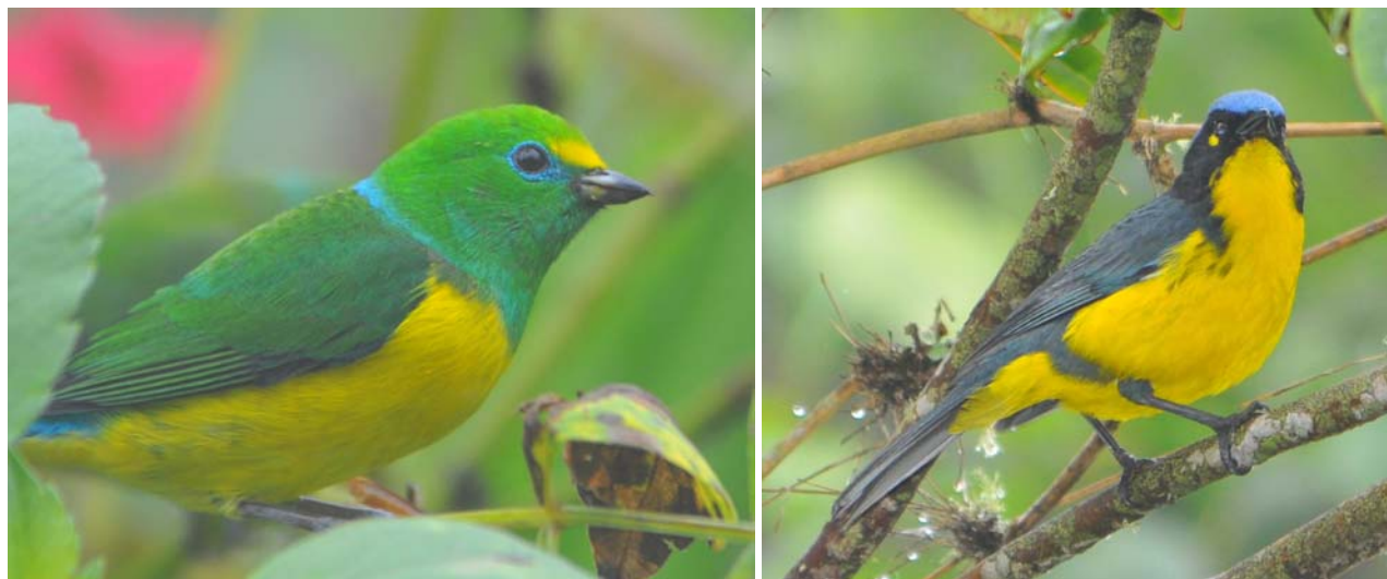
Blue-naped Chlorophonia; Santa Marta Mountain-Tanager (both Sierra Nevada de Santa Marta)

Although we would no longer be able to visit La Guajira, the upside was a chance to enjoy the flock of 10+ Chlorophonias visiting the feeding table at the El Dorado lodge and an additional morning of birding at the mid-elevations of the San Lorenzo ridge. Within a few minutes of dawn we had seen White-tipped Quetzals, Masked Trogons and Golden-breasted Fruiteaters and as we descended down the mountain we added endemic Blossomcrown and White-lored Warbler, plus a responsive Rusty-breasted Antpitta. Santa Marta Antpittas continued their habit of taunting us without ever appearing into view, meaning that our list of Santa Marta endemics seen was stuck on unlucky 13.