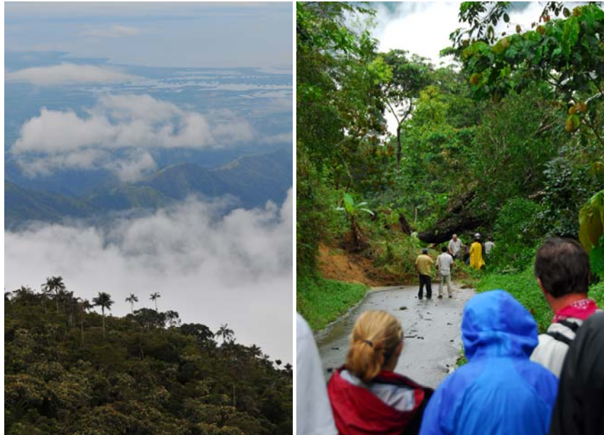
View from San Lorenzo towards Caribbean (Sierra Nevada de Santa Marta); Minor landslide (near Minca)