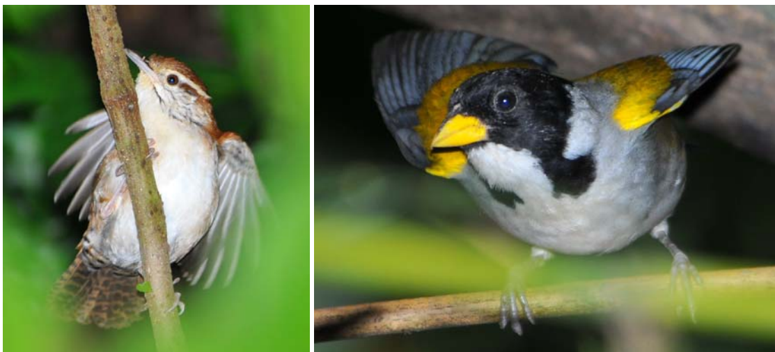
Rufous-and-white Wren (Minca); Golden-winged Sparrow (Minca)

Our final days of birding should have been in search of xerophytic specialities in La Guajira, but given the road conditions we instead returned with Waly to bird around Minca on the lower slopes of the Cuchilla de San Lorenzo. With Waly's Landcruiser still stuck up the mountain, we caught a pre-dawn taxi to Minca and spent the morning slowly walking up and down the quiet road to Pozo Azul that covers an altitude ranging from 600m to 750m. Although there are no endemics in this altitude range there are a lot of birds, several of which were new to us. Key targets were the Golden-winged Sparrow (which were seen regularly and well as they foraged in roadside vegetation) and Rosy Thrush-Tanager (which were heard calling several times but proved frustratingly difficult to see until a male was finally tracked down after a scramble up a steep slope). We had fun enticing Southern Nightingale Wrens, Rufous-and-white Wrens and Buff-breasted Wrens into view and admired Emma's first Blue-crowned Motmot, whilst one mixed flock that had been agitated by an Andean Pygmy-Owl provided some head-twisting excitement. Whilst the upper elevations of the Cuchilla de San Lorenzo provide the unique thrill of seeing a large number of very range restricted endemics, these lower elevations are certainly worth a morning's birding for those interested in plugging gaps in their neotropic list.