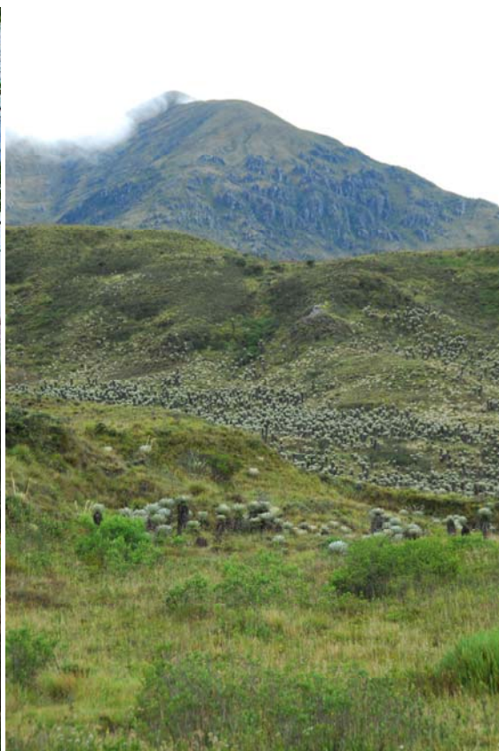
Forested ridge above La Victoria town square; Páramo en route to Soatá