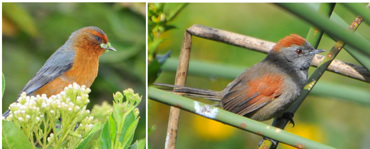
Rufous-browed Conebill (PNN Chingaza); Silvery-throated Spinetail (Parque La Florida, Bogotá)