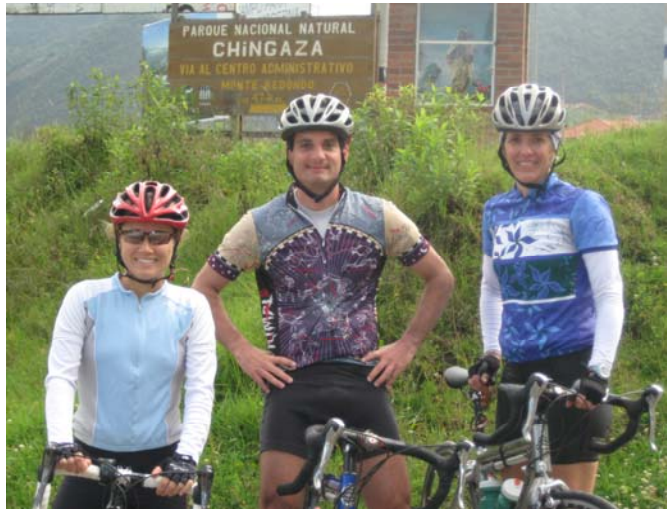
Botero Museum (Bogotá); Cycling in countryside near to Bogotá