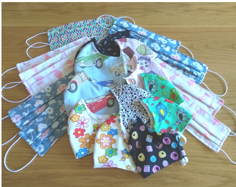
Photo shows a selection of the child - friendly fabrics, members chose for making the face masks. Hopefully this will make the wearing of facemasks by visitors less scary for the children in hospital.