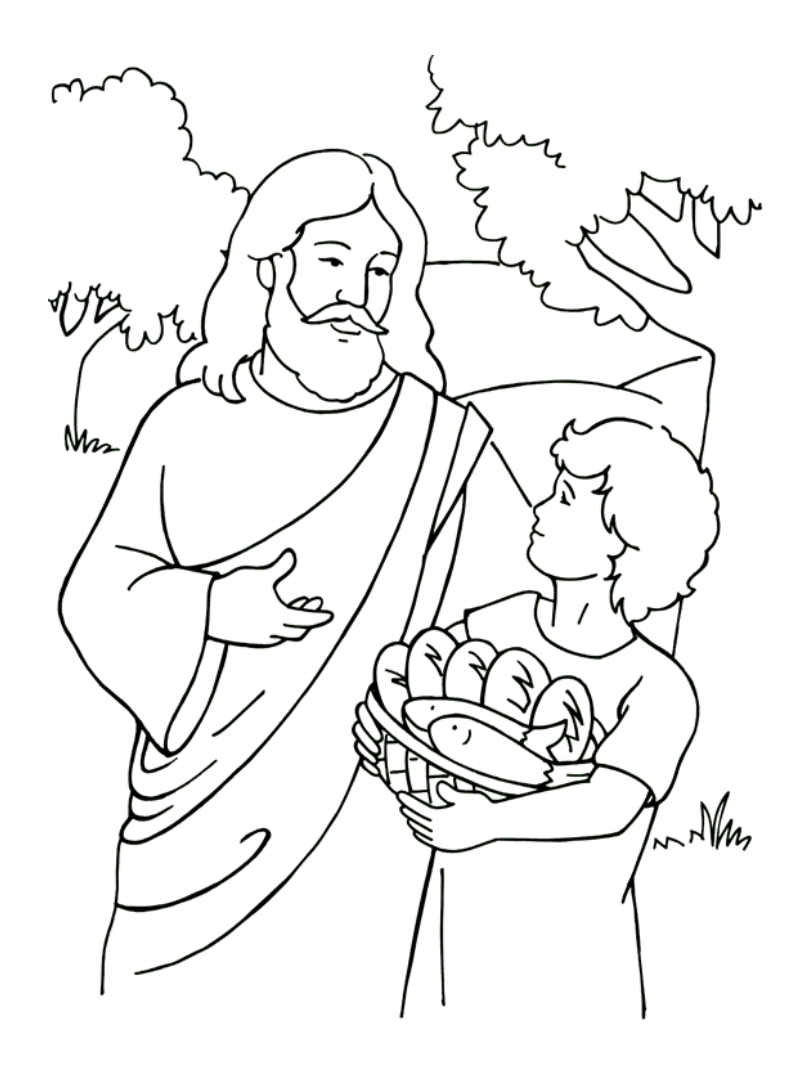
Jesus Feeds 5,000

From Thru-the-Bible Coloring Pages for Ages 4-8. © Standard Publishing. Used by permission. Reproducible Coloring Books may be purchased from Standard Publishing, www.standardpub.com.