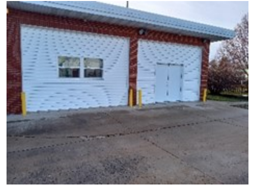
Outside of New Addition

A great big thank you to the Village Board for this very generous donation.