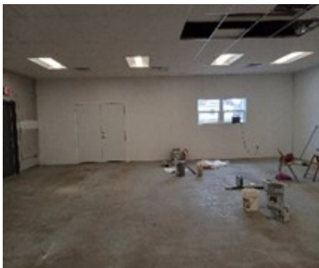
Inside of Outside Wall

We are planning to have a couple of programs this year. We are looking for some suggestions. We will be open on the 4 th of July prior to the parade.