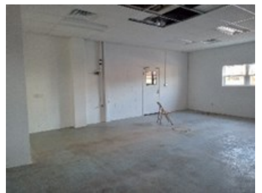
Entrance to Existing Building