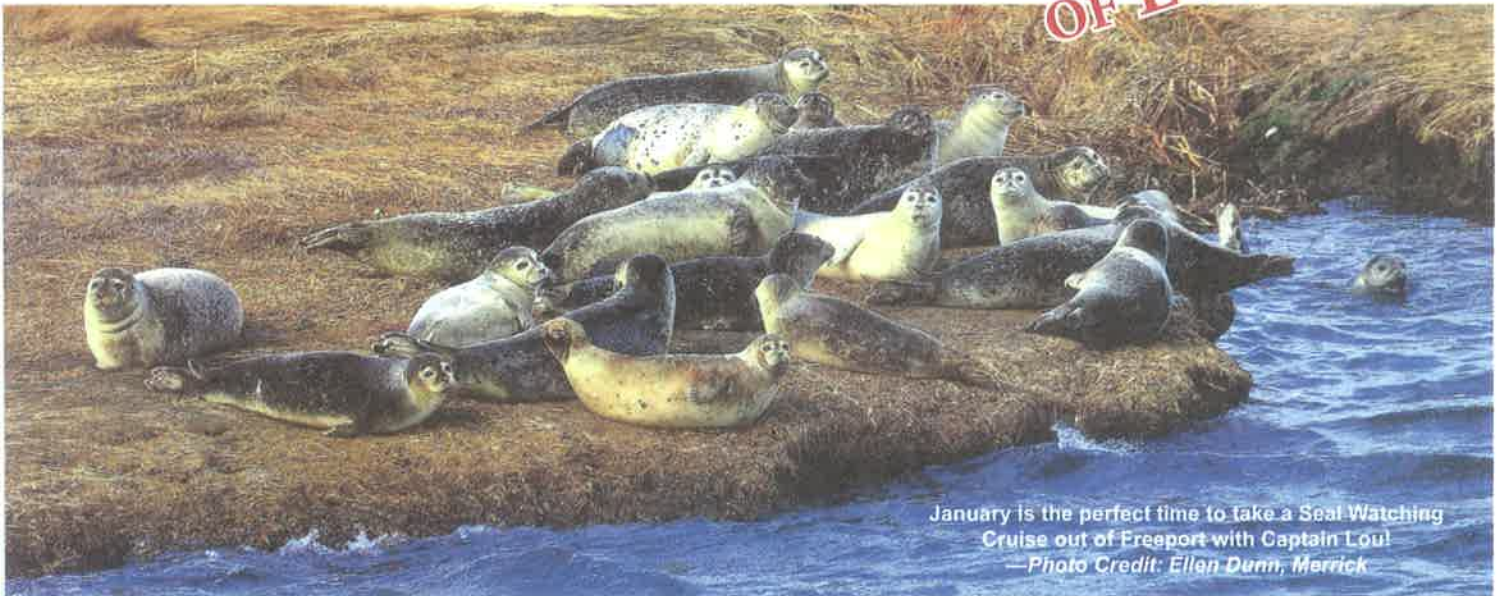
January is the perfect time to take a Seal Watching Cruise out of Freeport with Captain Lou!