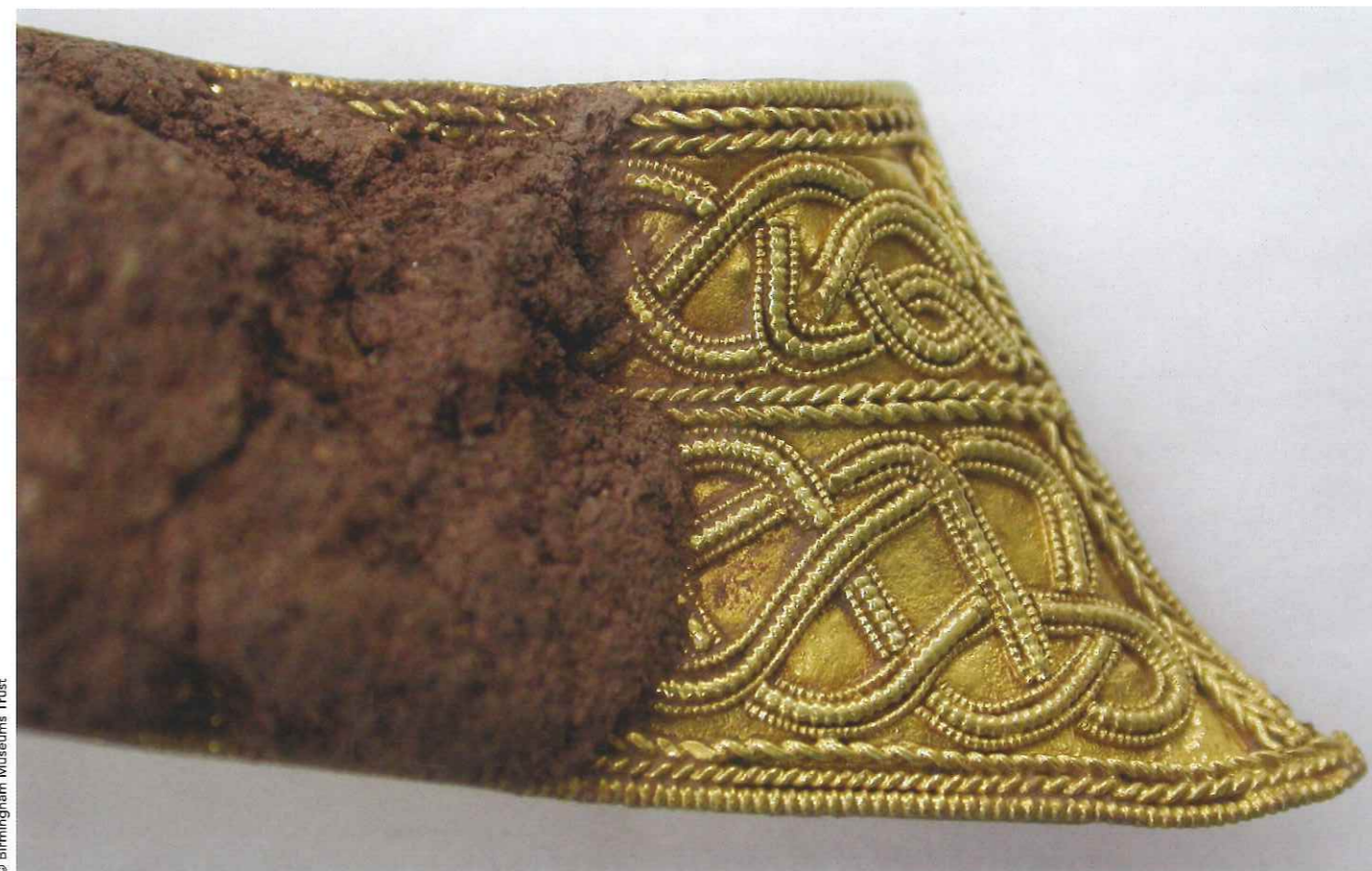
The results of careful cleaning with thorns

A few potential risks to using thorns have been identified, the first one being that insects might hitch a ride into the studio on the thorns and their associated branches and leaves. To minimise this risk, bags of thorns are inspected prior to being brought into the museum, at which point they are held in the conservation offices instead of the studio until they are ready to be clipped. The second risk is that some natural substance such as plant juice/sap might be transferred from the thorns to the objects. To minimise this risk thorns are inspected and only dry, clean thorns are used.