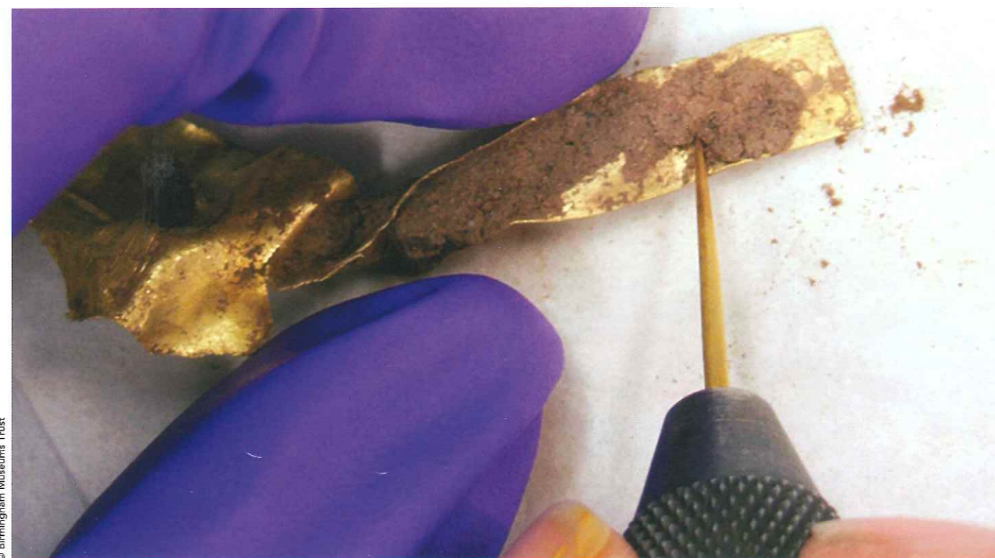
Cleaning with a thorn

For more information about the hoard and regular updates you can visit www.staffordshirehoard.org.uk