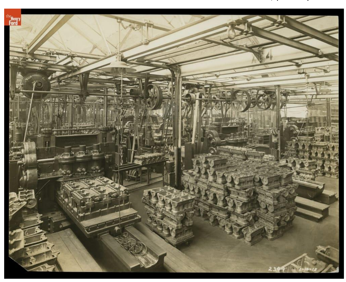
In this photo from 1915, you can see Model T engine blocks stacked upside down like cordwood at the Highland Park facility.

Cast in bed: THE INGERSOLL MILLING MACHINE CO. ROCKFORD ILL. U.S.A. Cast in cross rail: THE INGERSOLL MILLING MACHINE CO. ROCKFORD ILL. U.S.A. / patd. July 8 1912