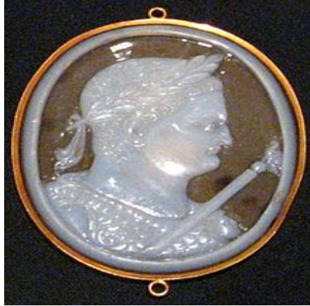
Chalcedony cameo of Titus head, 2nd Century AD

Rock of the Month: Chalcedony and/or Chalcedony Roses, “best identified by its dull, waxy appearance, conchoidal fracture, and often beautiful colors. It can be semitransparent to translucent or even completely opaque. Chalcedony and crystalline quartz are chemically the same, but chalcedony is microscopically crystallized and usually contains impurities. The surface tends to be botryoidal and is often smooth. The best formed bubbly pieces are referred to as chalcedony roses.” page 74, The Rockhound’s Handbook , By James R. Mitchell.