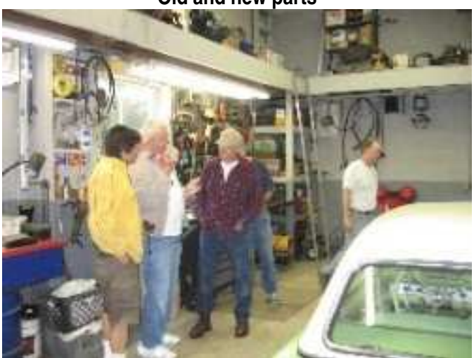
A weighty discussion