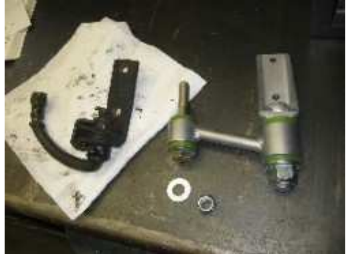
Old and new parts