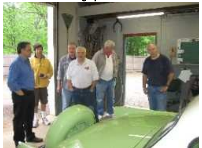
Job well done