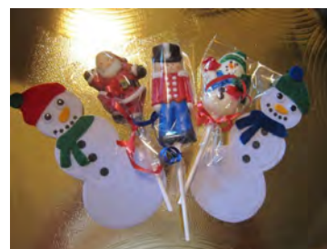
Examples of the lollipop treats given out at the luncheon