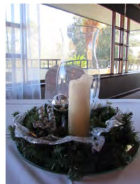
Pretty centerpiece at Timacuan Country Club