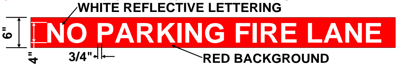
Figure D103.7 Fire Lane Striping. Add a new Figure D103.7. Fire Lane Striping. As follows:

Section D103.8 Signage. Add a new Section D103.8 to read as follows: “D103.8. Signage. When signage is used to identify fire lanes, the signage shall comply with this Section and Figure D103.8 or as approved otherwise. Signage shall be permanent, bearing the words “NO PARKING FIRE LANE”. Signage shall have a white background with red letters and borders using not less than two inch lettering and have a minimum dimension of 12 inches wide by eighteen 18 inches high. Signage shall provide directional arrows as applicable unless otherwise permitted. Signage shall be posted on one or both sides of the fire lane as required by Section D103.6. Signage shall indicate the beginning and ending of the fire lane and shall be spaced no more than 100 feet apart. Additional signage may be required at changes in roadway direction. Signage may be installed on permanent buildings or walls in an approved manner or as approved by the fire code official. Signage shall meet applicable requirements of the Federal Highway Administrations Manual on Uniform Traffic Control Devices (MUTCD).”