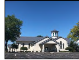
August 30, 2020

To register go to nsoregion.formed.org and sign up.