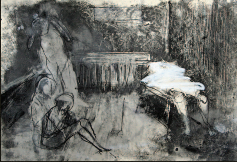
Paula Everitt Iraq - 2011 Monoprint