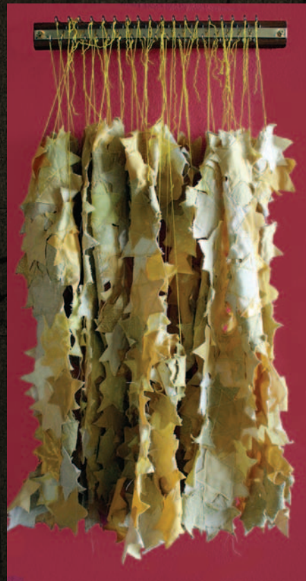
Stacy Isenbarger IMMIGRANT (non holocaust status) Mixed Media