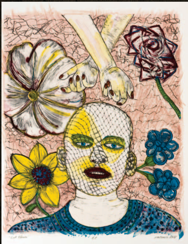
Gregory Grenon Cut Flower Color Litho Graph