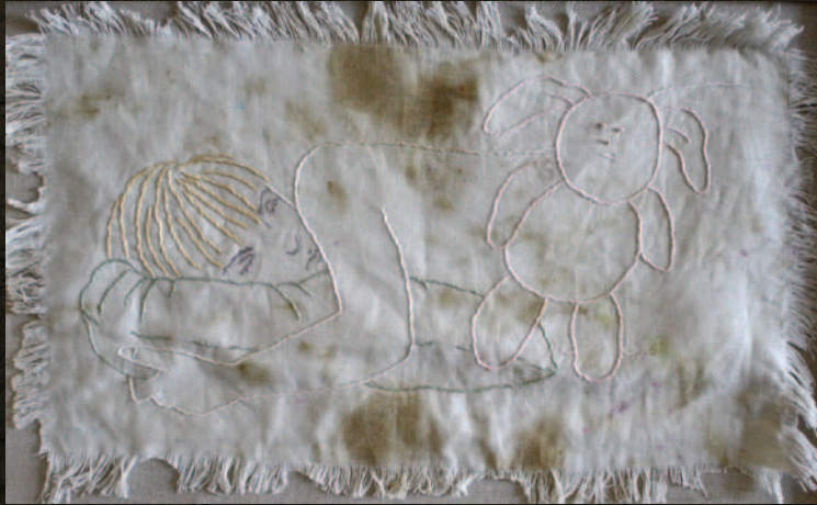
Future Akins Stolen Innocence Fiber Arts/ Embroidery