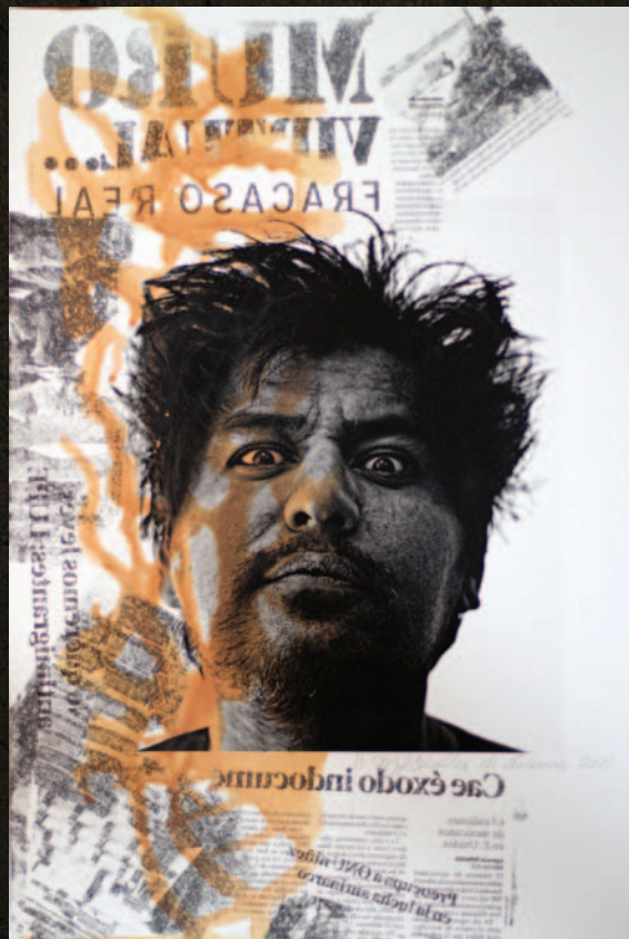
Marina Salinas Untitled Mixed Media