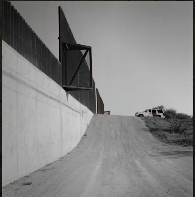
Efrain Salinas El Muro 61 Photography