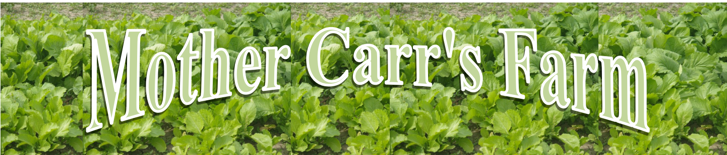
A Community Supported Agriculture Project of Vernon Park Church of God