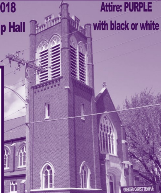
GREATER CHRIST TEMPLE