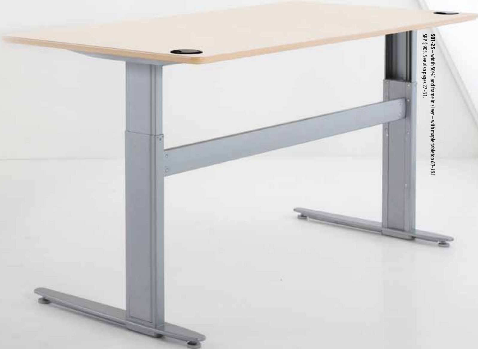
501-25 – width 50 7 / 8 " and frame in silver – with maple tabletop 60-305. SRP $ 905. See also pages 27-31.