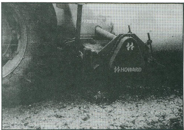
Mixing lime into soil