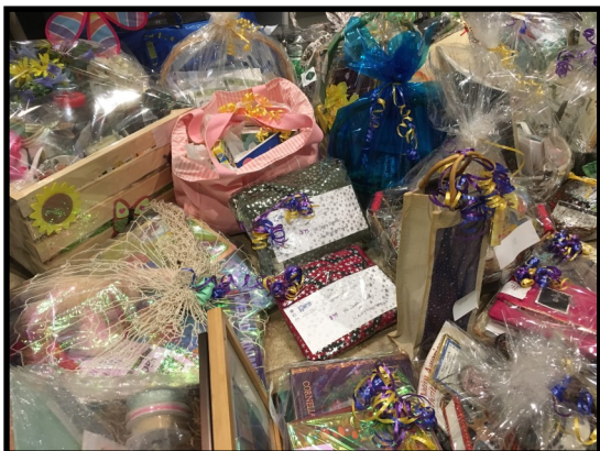
Beautiful Auction Baskets Ready to Go

Thanks to the board of the Woodland Friends of the Library and all our fabulous volunteers for making the annual Mystery Night a success.