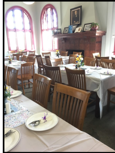
The Carnegie Library Transformed