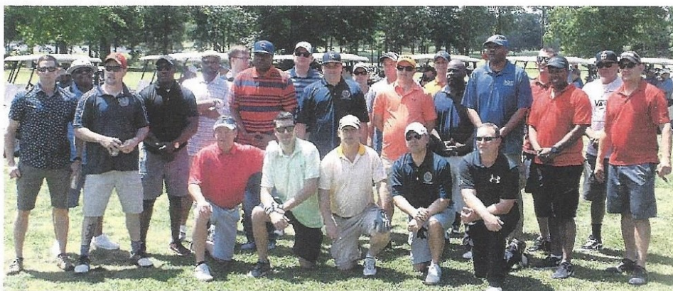
Having nine foursomes in-play is a wonderful demonstration of the strong support council received from NRD (Navy Recruiting District-Richmond). Note: not all NRD teams are represented in photo.