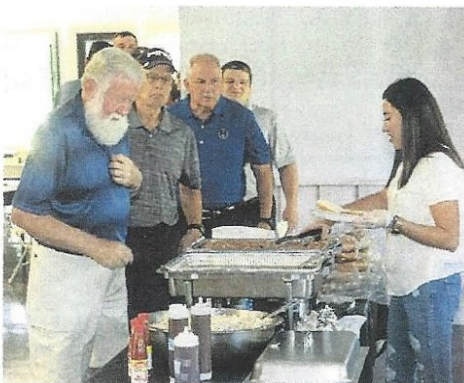
Before Tee Time, golfers enjoyed a BBQ lunch

Special thanks to all the Richmond Navy League board members and golf committee who volunteered many long hours in preparation for and on the day of the outing. We also thank the staff of The Hollows who did a fantastic job of preparation and service especially in view of our larger than expected number of golfers. We could not have done it without all of you.