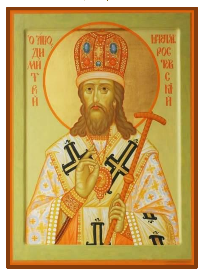
Sts. Peter & Paul Orthodox Church Youngstown, Ohio 44509