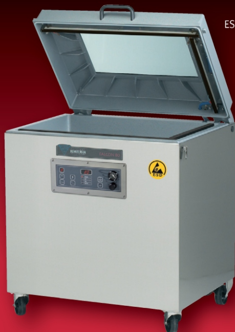
Foto: Falcon 80 ESD configuration