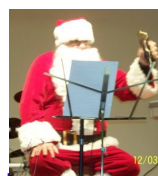
A special Guest