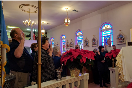
Parish Committee recites Oath of Office