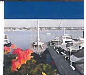
Enjoy the historic Portland Waterfront

Departure: Scenic Hills Senior Center, 187 South Spring St, Logan, OH @ 8 am