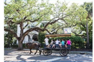
Tour Charleston by Horse and Carriage