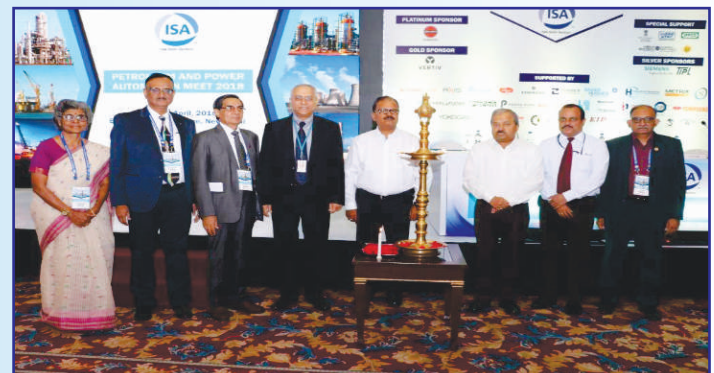
Lamp Lighting by senior official from IFFCO IOCL, EIL IGL and other dignitaries at PPA Meet, Eros Hotel, New Delhi on 20-21 April 2018