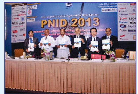
Release of Souvenir by Dr M Veerappa Moily, Minister (P&NG) and Directors from NTPC, EIL, IOCL, Hitachi at PNID 2013, Hotel Taj Palace on 3rd Oct. 2013