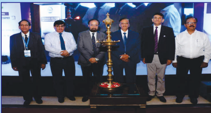
Lamp Lighting by Directors and senior Directors from NTPC, IOCL, EIL IGL and other dignitaries at PPA Meet, Eros Hotel, New Delhi on 21-22 April 2017