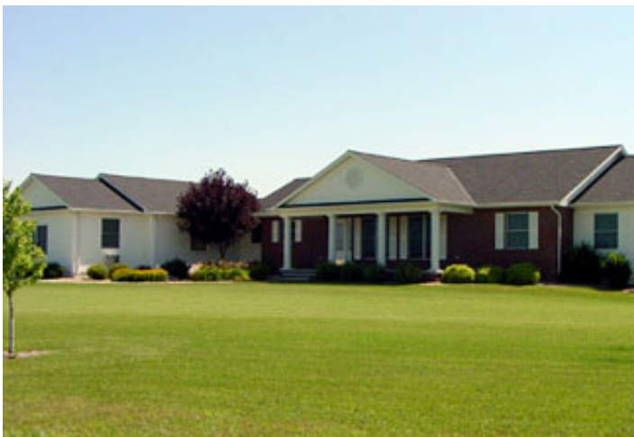
Christian Heritage Central Office – Kearney, NE (where I work)