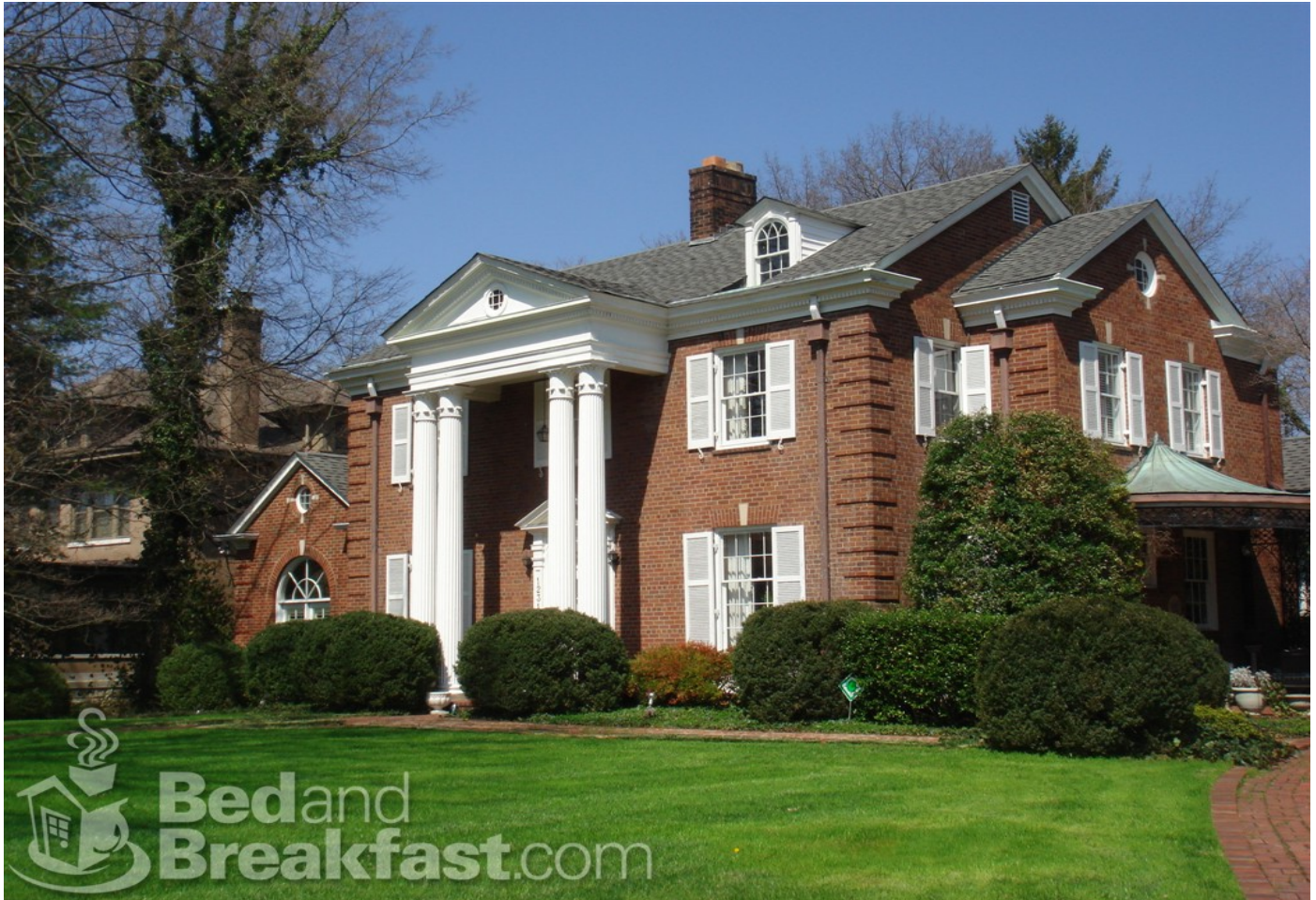
THE MAGNOLIA HOUSE BED AND BREAKFAST Circa 1940