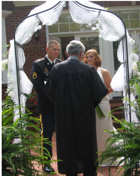
Vows Renewal Ceremony

“Sometimes, especially during major campaign years, we hear much negativity about our country and what we have or have not done. I'd like to focus on some government employees that do it right, over and over again. Where ever we send them and whatever we ask them to do, they rise to every occasion. The men and women of our Armed Forces- May God bless and keep each and every one.”