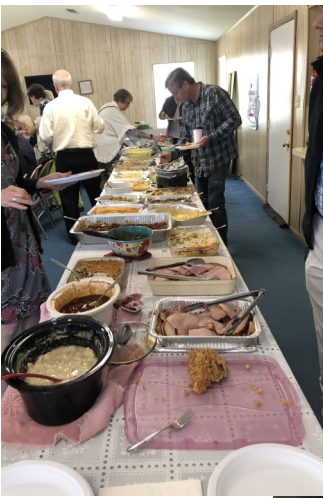
We had a wonderful luncheon!