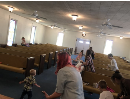
We moved the Easter Egg Hunt inside due to weather, but that didn't stop the kids from finding 500 eggs in a matter of minutes!