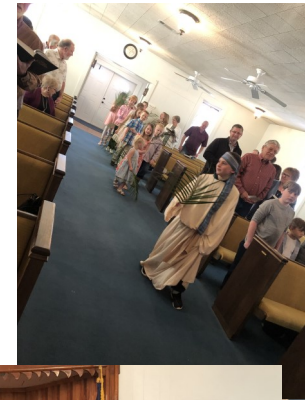
"Jesus" leading the children's palm processional