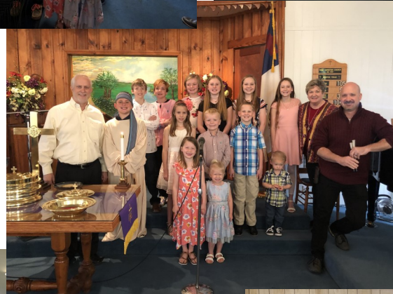
Thank you to everyone who helped with the children's choir performance. The kids did amazing!