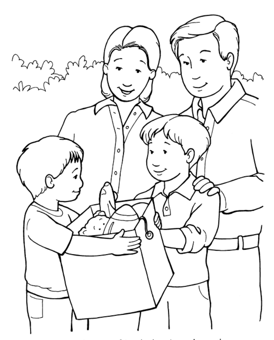
I can show my friends that Jesus loves them.

From Thru-the-Bible Coloring. © 1986,1988 Standard Publishing. Used by permission. Reproducible Coloring Books may be purchased from Standard Publishing, <a href="https://www.standardpub.com">www.standardpub.com</a>, 1-800-323-7543