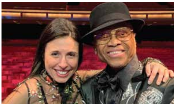
She had the distinct honor of directing Sonny Turner, the iconic 1959 lead singer of The Platters, in Montreal - Place Des Arts.