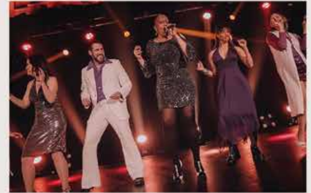
DIRECTOR AND CHOREOGRAPHER Saturday Night Fever