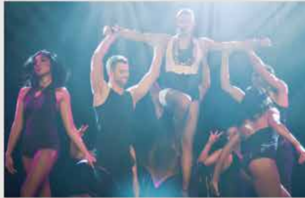
DIRECTOR, PRODUCER AND CHOREOGRAPHER Musical Show: Forever Broadway - Rialto Theatre