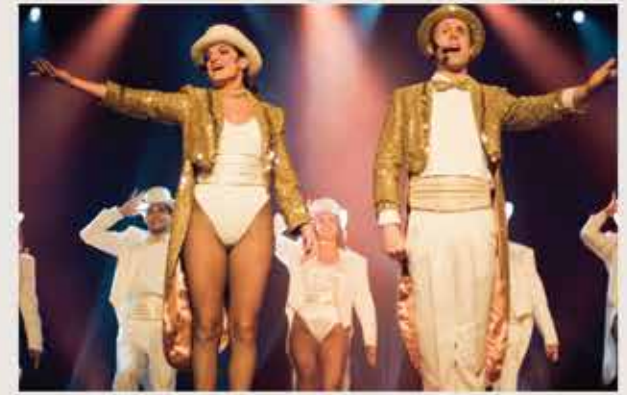
DIRECTOR, PRODUCER AND CHOREOGRAPHER Musical Show: Forever Broadway - Rialto Theatre