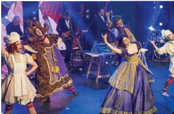
DIRECTOR AND CHOREOGRAPHER Beauty and the Beast Show