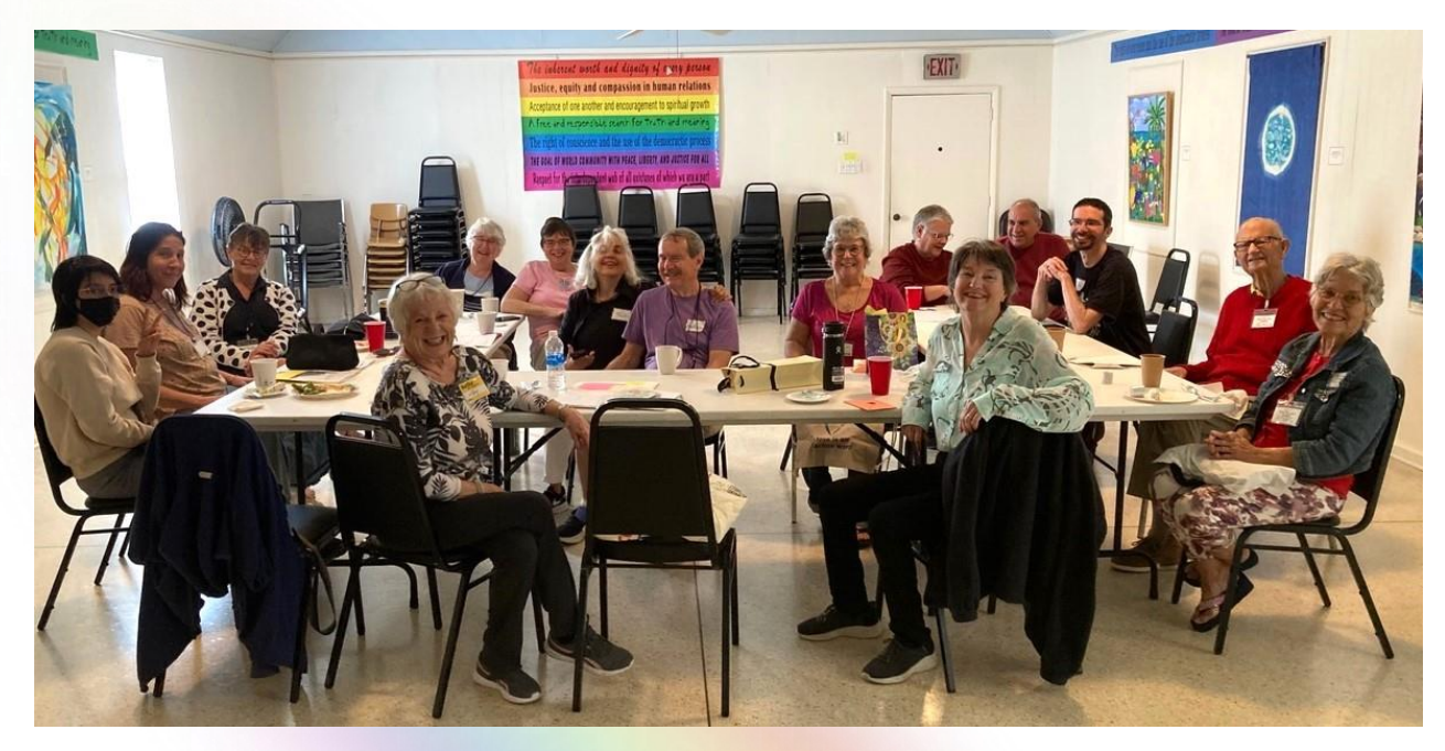
Members and attendees at our Annual Meeting and luncheon.