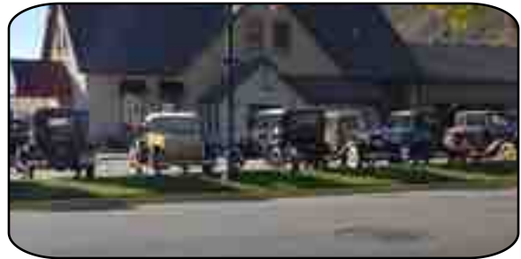
And of course we had to have Ice Cream!