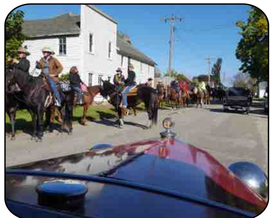
Whitewater photos continued next page