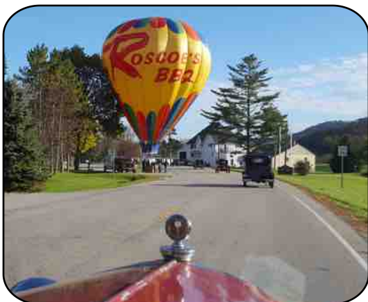
A Huge thank You to the Lady Slipper A's for a great tour!!!!