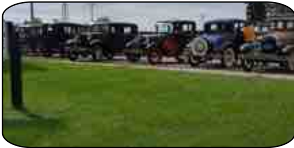
Fillmore County Historical Center