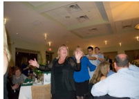
A good time was had by all!