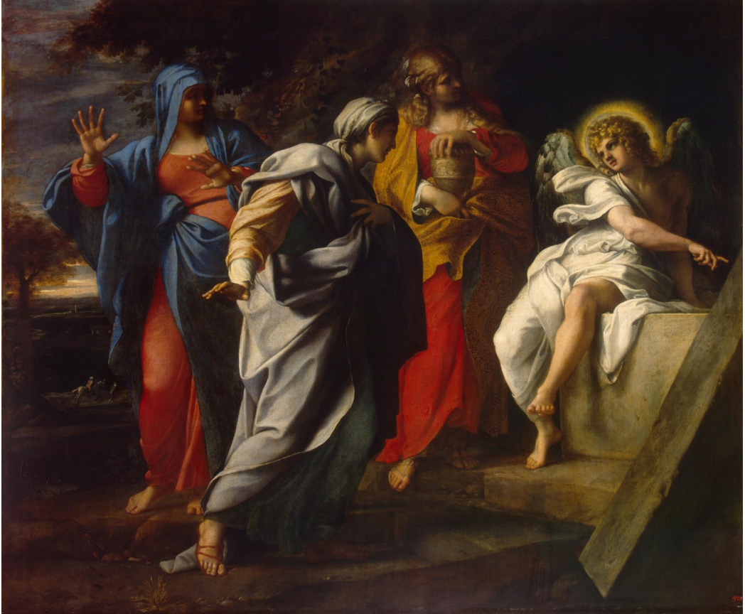
Annibale Carracci Holy Women at Christ's Tomb, 1590