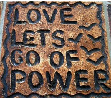
Love Lets Go of Power, Tile from Peace Wall in Hamilton, New Zealand

We are glad you are here! No matter who you are or where you are on life's journey, you are welcome at Hope UCC!