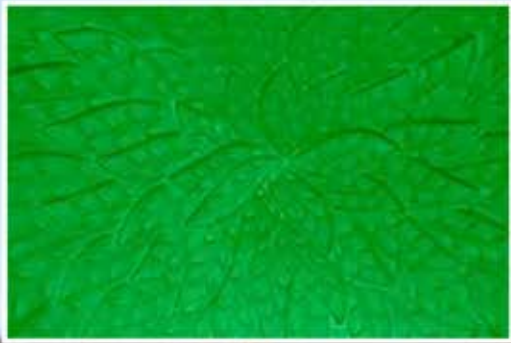
Roofs feature leafy canopy underside!