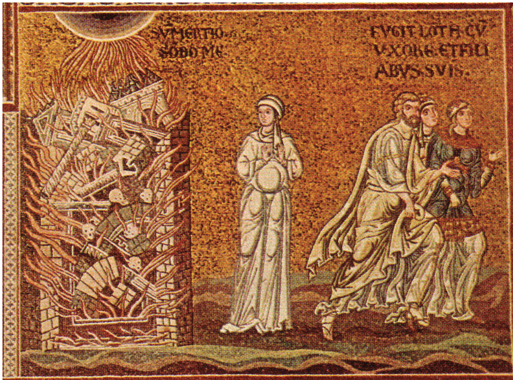
Mosaic in 12th century Cathedral, Monreale, Sicily. On the right, Lot and his daughters are fleeing from the destruction of Sodom. In the center, Lot's wife is about to be turned into a Pillar of Salt for having looked back at Sodom, thus suggesting that she was no prude herself. The phallic symbolism is pretty obvious.