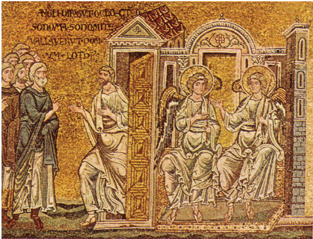
Mosaic in 12th century Cathedral, Monreale, Sicily. On the left, Lot is rebuffing men of Sodom, who wish to “know” (have sex with) the two androgynously attractive angels on the right. The two angels don't look particularly adverse to the Sodomites' proposal.