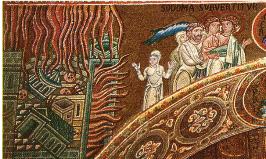
SODOMA SUBVERTITUR – The destruction of Sodom. 12th century mosaic , Palatine Chapel, Norman Palace, Palermo, Sicily.