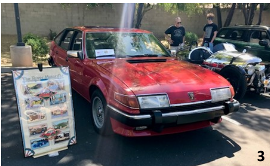
Photo 3- 1985 Rover SD1 Vitesse