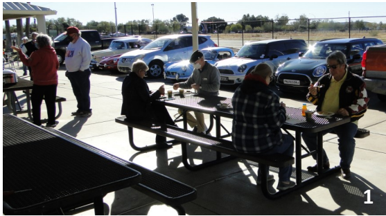
Photo 1- Just after people started to arrive.