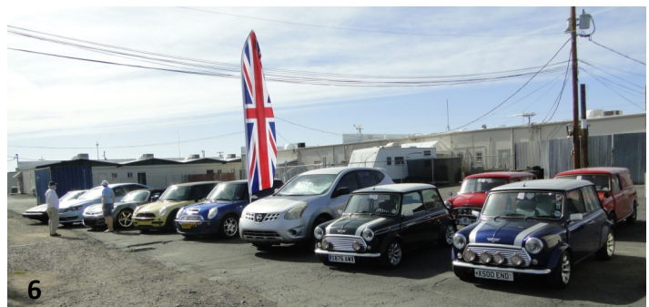
Photo 6- Cars at the end.