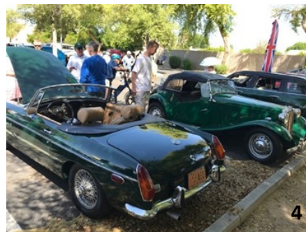
Photo 4- 1952 MG TD and 1970 MG B