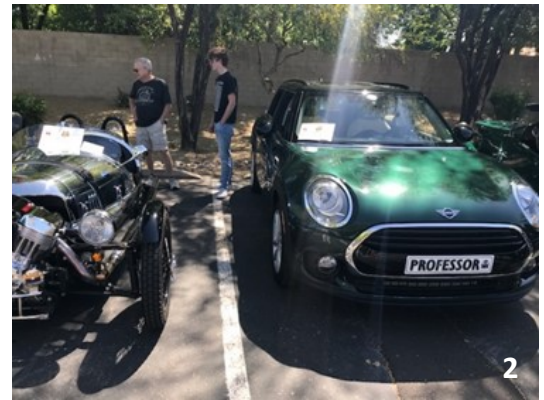
Photo 2- Paul V's 2019 MINI Clubman and a 2019 Morgan Three-Wheeler