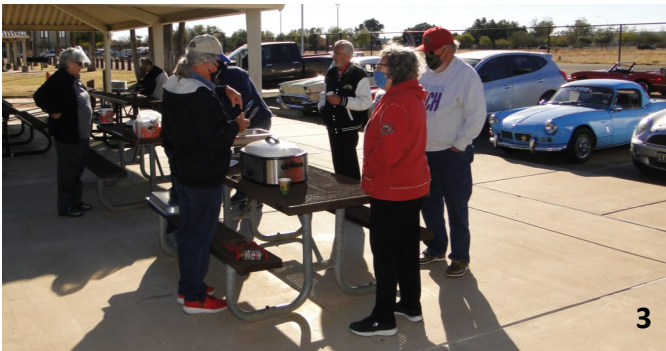
Photo 3- We did things differently this with people being served instead of helping themselves.