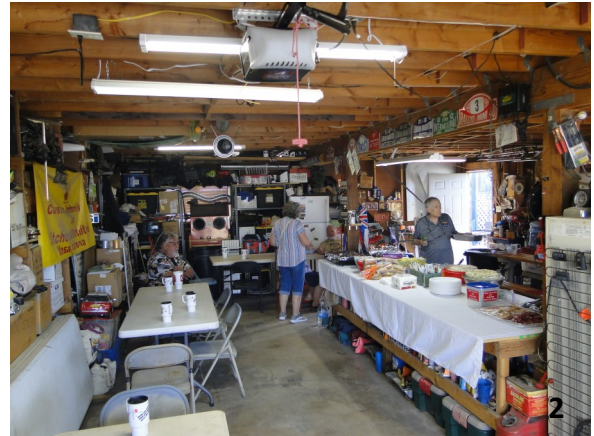
Photos 1, 2, 3, 4 & 5- At the finish everyone enjoyed Hamburger's, Hot Dog's, Brat's with all the fixings.