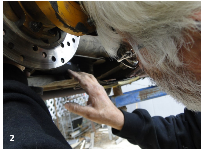
Photos 2 & 3– Cleaning out the old nylon cup getting ready to put in the new “Smooth-a-ride” cones and adjustable trumpets.