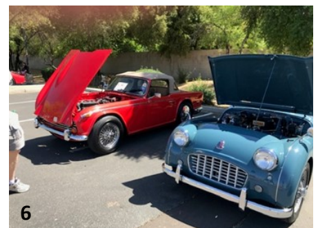
Photo 6- 1968 TR250 and 1957 TR2