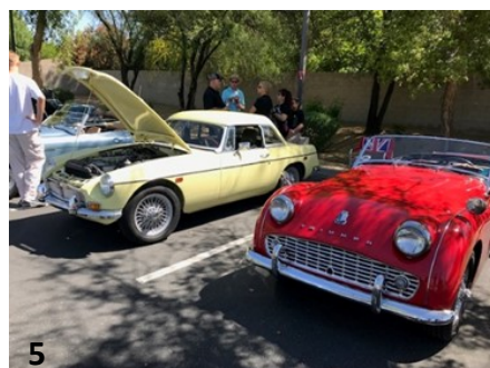
Photo 5- 1965 MG C and 1968 TR3