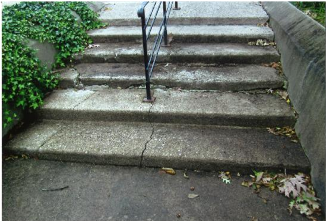
Existing concrete steps and railing (looking east)