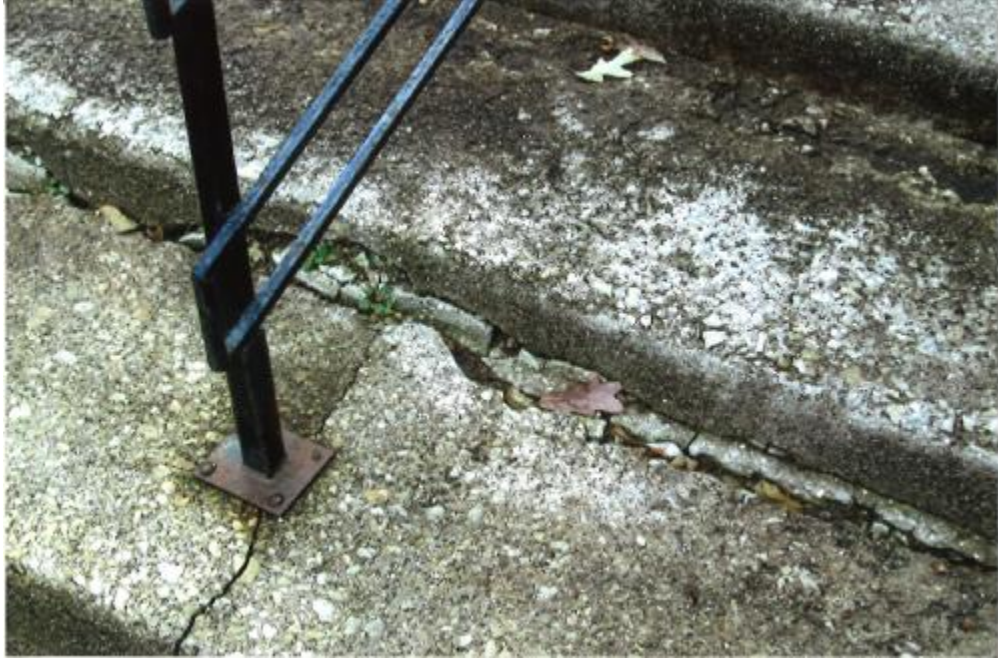
Closeup showing cracks and deterioration of concrete steps; railing to be reused in new work