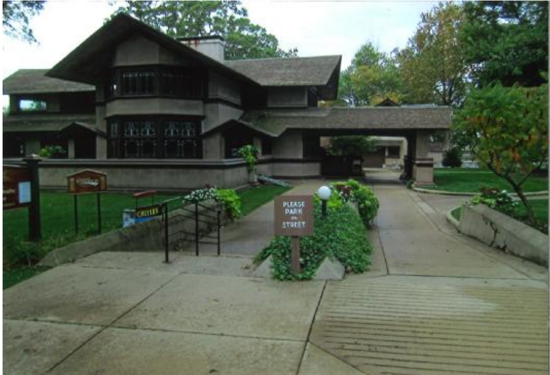
View of Bradley House looking west showing street entrance concrete steps, ramp, drive and side walls.