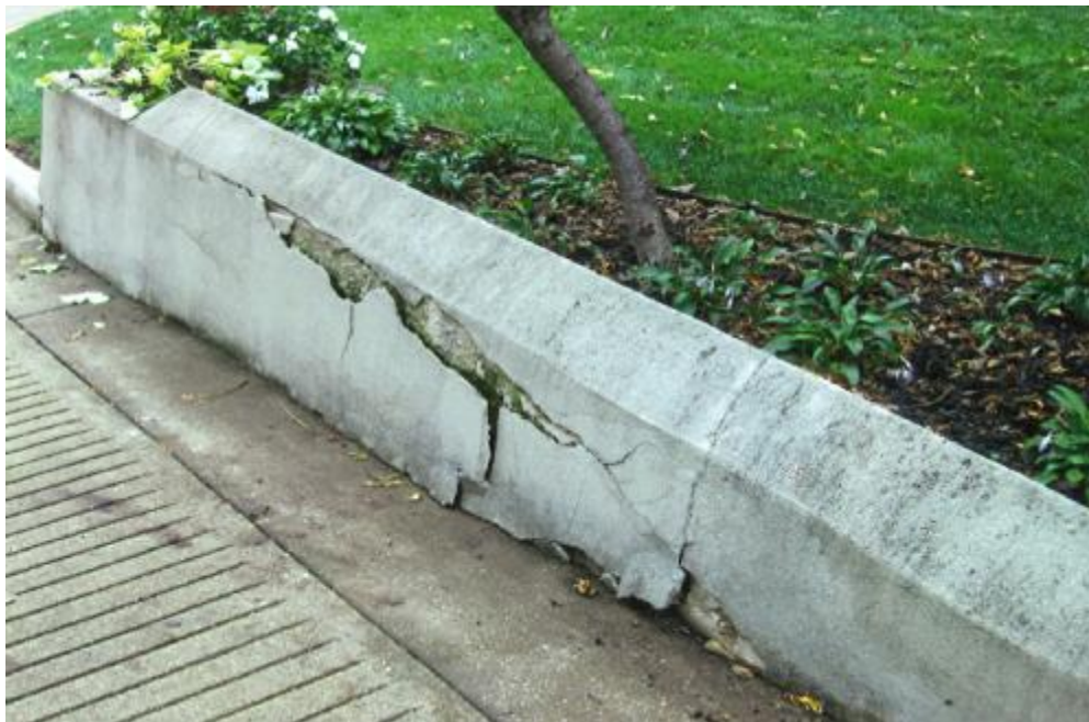
Delamination of stucco covering on concrete sidewalls along with transverse crack in wall