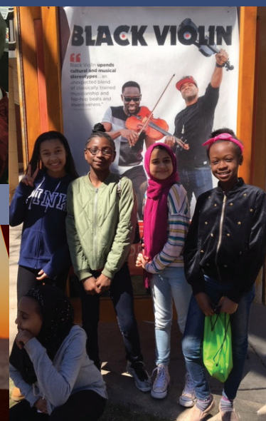
Garden City Elementary Project: Stomping Out Stereotypes