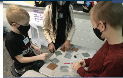
Oak View Elementary Project: Bakken Frogs, Volts. and Vinegar

The annual Investment in Youth event celebrates students, volunteers, and staff in Osseo Area Schools. Each site submits two award recipients to be recognized at this special celebration for their commitment and dedication to our community.