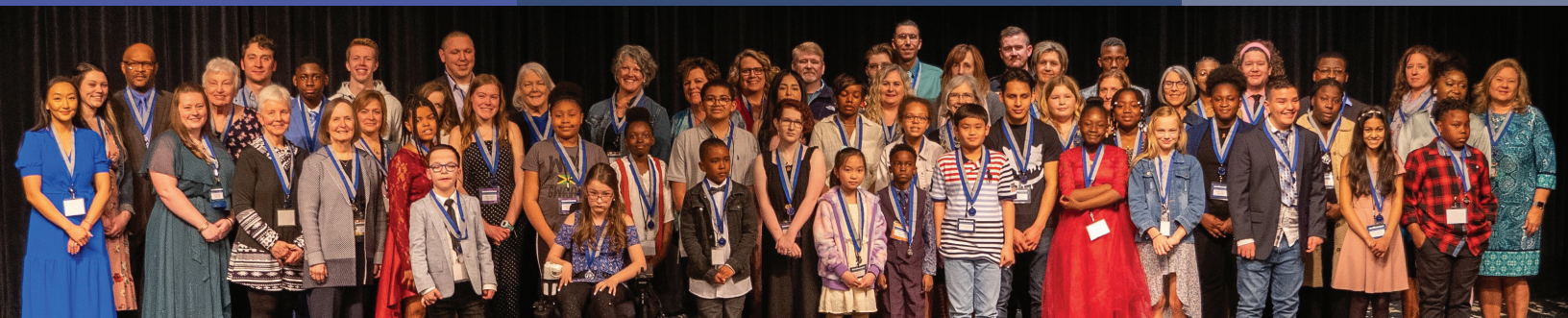
Investment in Youth 2022 Award Recipients