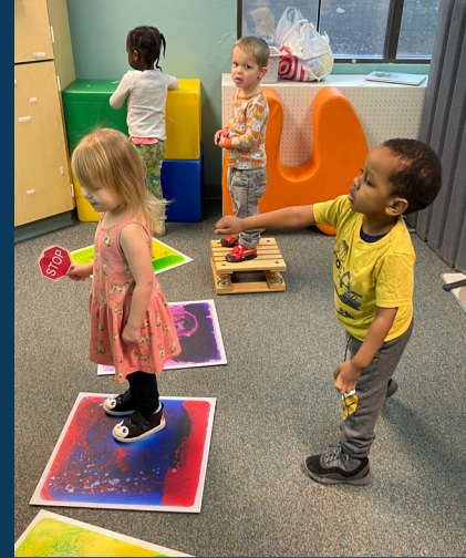
Willow Lane Early Childhood Special Education Program: Self-Regulated Scholars