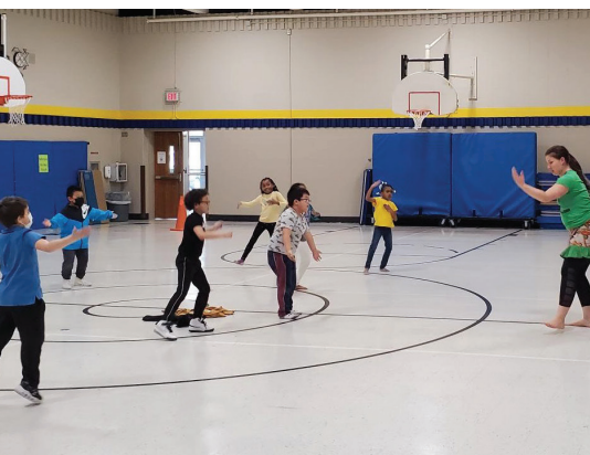
Birch Grove Elementary Project: Moving Minds