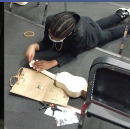
Brooklyn Middle School Project: Make Your Own Music