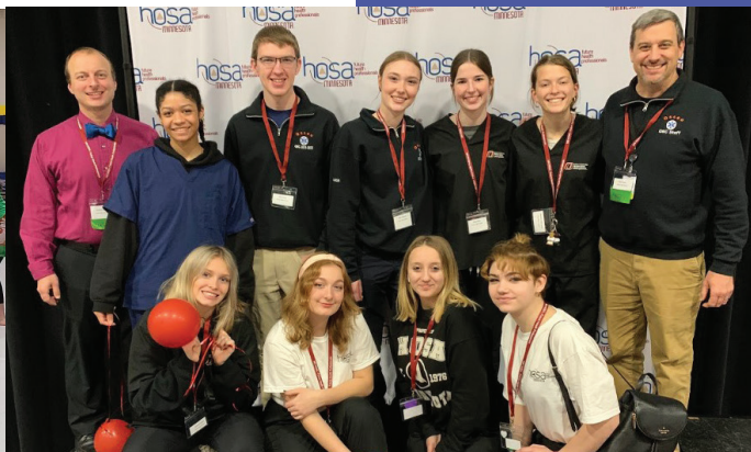
Osseo Senior High Program: Minnesota HOSA State Leadership Conference