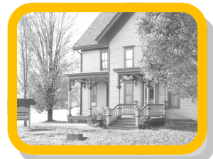
Janet Bowers Site circa 1870