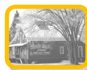
Pitcher's Mill circa 1830