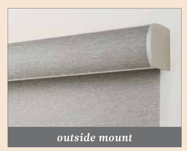
(Note: Limited window depth)