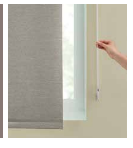
Pull on cord to slide panels open and closed. Can stack right or left.