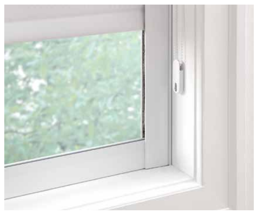
Aluminum channels prevent light leaks around the edges and bottoms of shades, and also help insulate when paired with blackout material. Available in White or Anodized Aluminum.