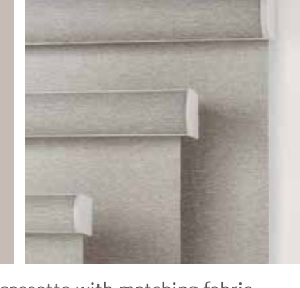
The sleek cassette with matching fabric insert hides the roller mechanism and provides a finished look. Available in three sizes. White, Vanilla, Silver, Bronze and Black.