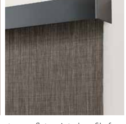
The fascia features a flat, painted profile for a clean look. Available in 3" and 4" in White, Vanilla, Silver, Bronze and Black.