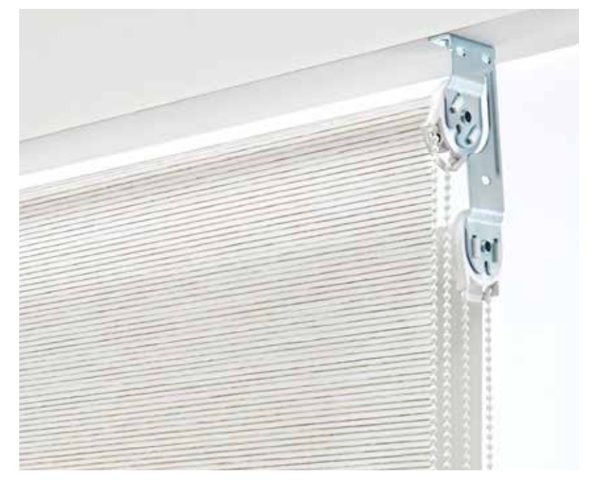
Two shades in one—to achieve greater light control, mount two separate shades of different opacities on one application.