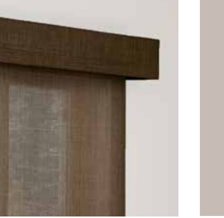
yield a streamlined, coordinated look.