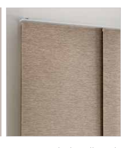
White track system is standard on all panel track shades; a valance is not included.