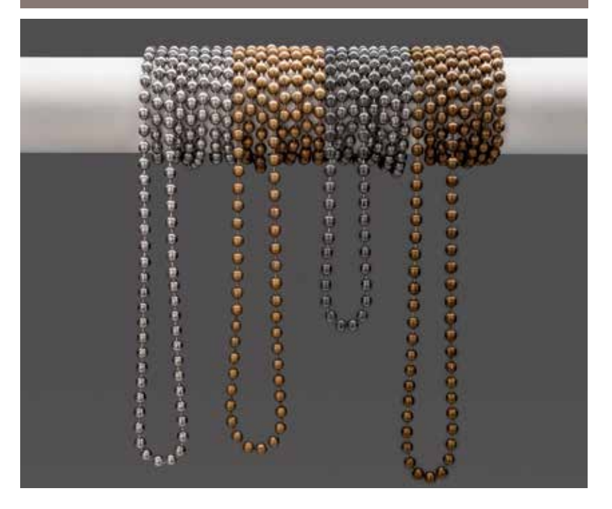
Colors (L to R): Nickel, Antique Brass, Stainless Steel, Oil-Rubbed Bronze. White and Black not shown. See the accessories book for choices.