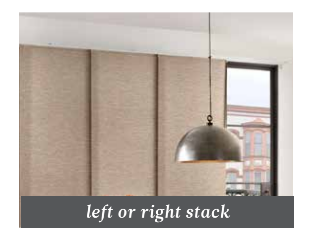
Panel Track is available in a left or right stack or split with the panels stacking left and right.