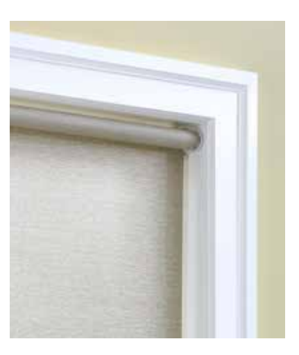
The standard shade comes without a valance or headrail.