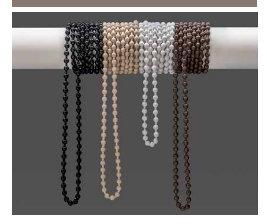
Colors (L to R): Black, Vanilla, White, Bronze. See the accessories book for choices.