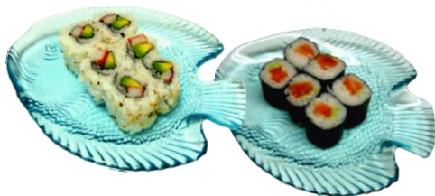
Sample of California Roll and Tuna Roll

Add $1 for miso/hot & sour soup or small green salad