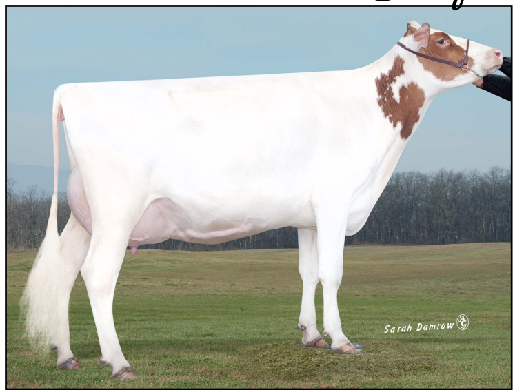
Stub-RF Olivia-Red EX-90 EX-MS 2nd Dam of #PolledPrize Heifer