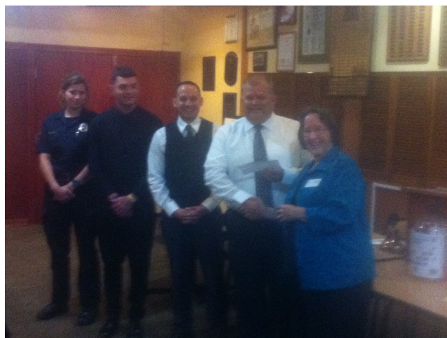
Fire Academy receives a check for $21,000 for Personal Protective Equipment for Students.

“A truly happy person enjoys the scenery on a detour”