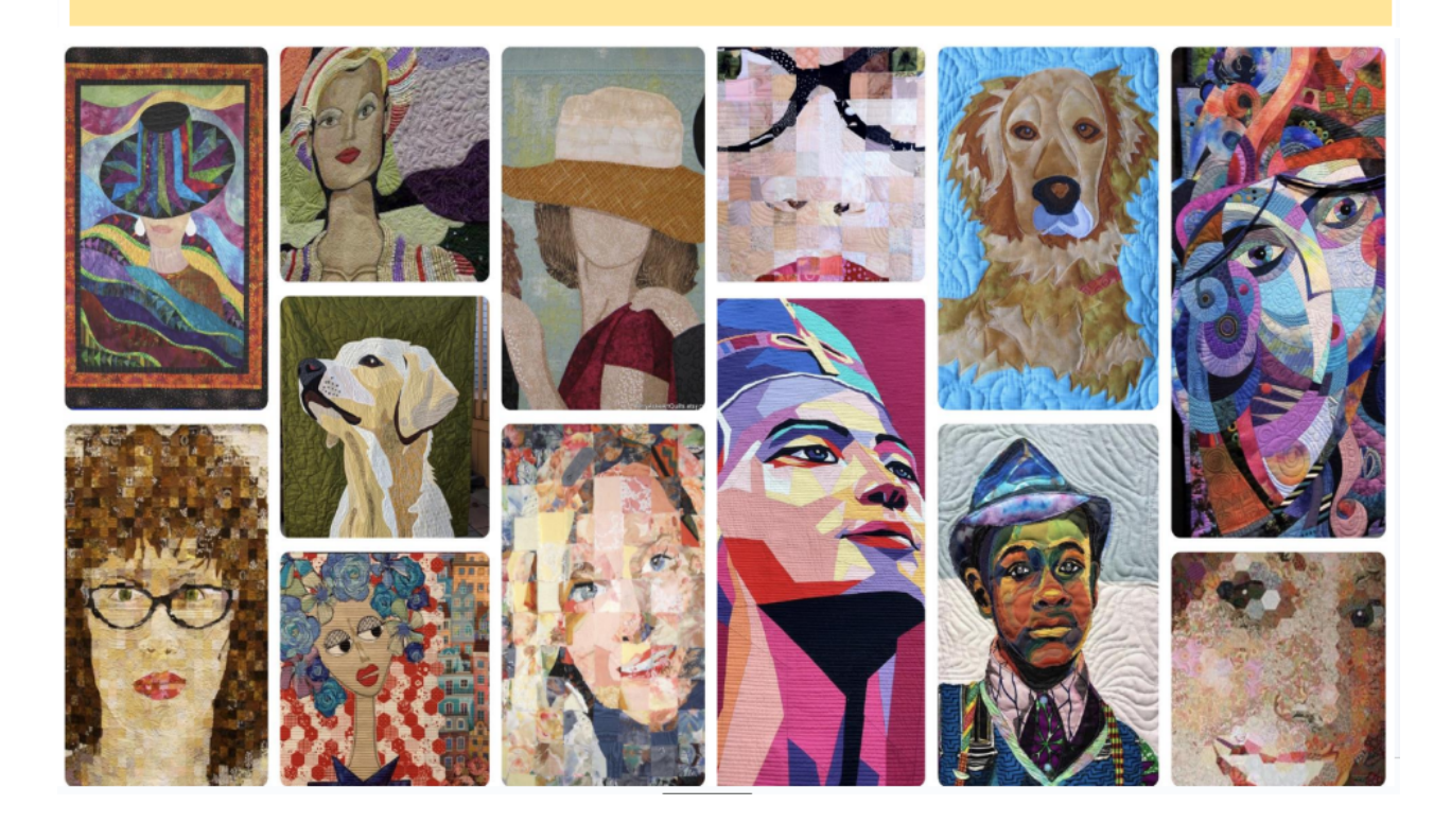
Challenge Registration Form

When submitting your challenge, please include a typed paragraph telling us about why you chose your subject matter. What about them inspires you? What have you tried to portray about them through your portrait? Make us feel like we know them too!