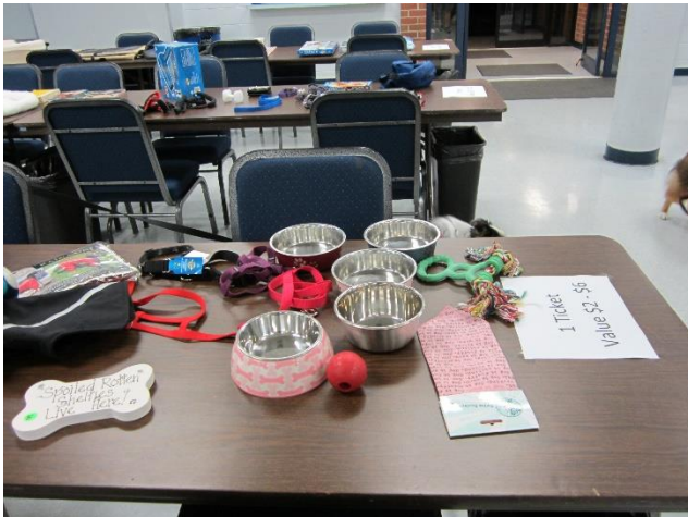
A plentitude of bowls, harnesses, collars and leashes on hand.