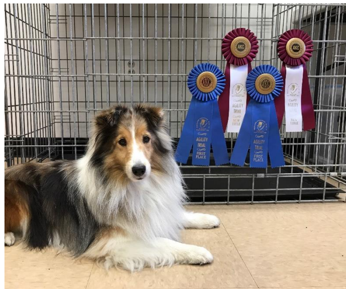
Mollie Excellent JWW Open FAST titles

At the Greater Baltimore Shetland Sheepdog Club specialty agility trials on September 23 & 24, Mollie Skoog earned her Excellent Jumpers with Weaves title (and placed FIRST) and also earned her Open FAST Title (and placed first). These were great agility trials because it was a Sheltie Specialty. . . Shelties competing with other Shelties. And it was great seeing so many sweet dogs and Sheltie owners.