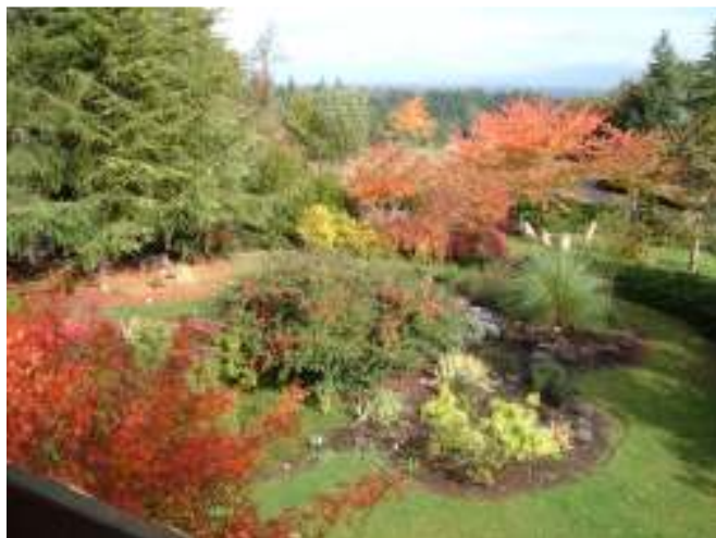
Fall Colors Are Coming