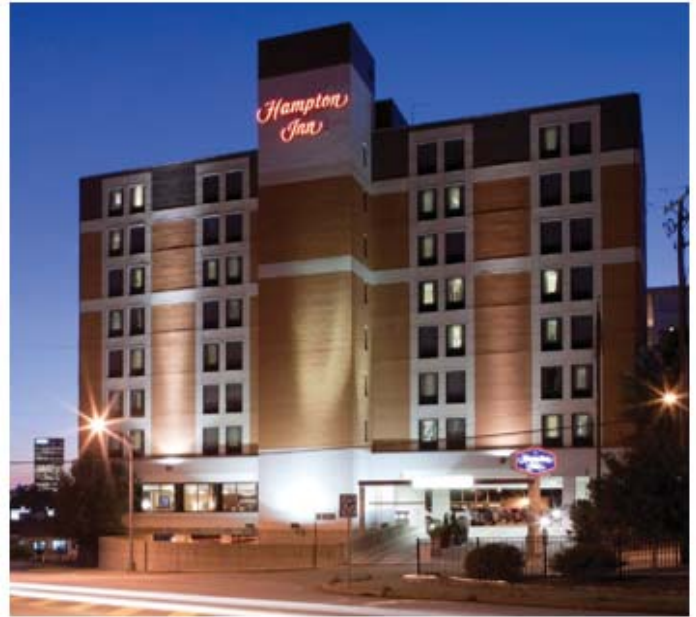
Hampton Inn Pittsburgh University/Medical Center 3315 Hamlet St., Pittsburgh, PA

You can call the hotel at 412-681-1000 to reserve your rooms. You would need to say that you are part of the Hovawart Dog Show group.