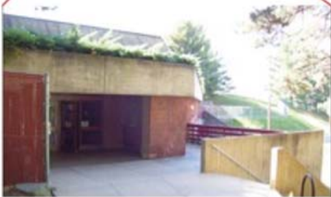
Ice Skating Rink Banquet Hall, Schenley Park Pittsburgh, PA Friday night

For Friday's meet and greet, we will be using the Ice Skating Rink Banquet Hall at Schenley Park. The figure above shows exact location of the building. Directions to the Rink from the Hampton Inn Pittsburgh University/Medical Center (our hotel) is to follow the Boulevard of the Allies and once inside the park to make an immediate right at the swimming pool onto Overlook Drive. Travel to top of hill to reach Schenley Oval and Rink to your left. You will be able to park on Overlook Dr. and then walk a short trail that takes you to the rink. If you reach the Schenley Oval Sportsplex, you have passed the trail to the rink.