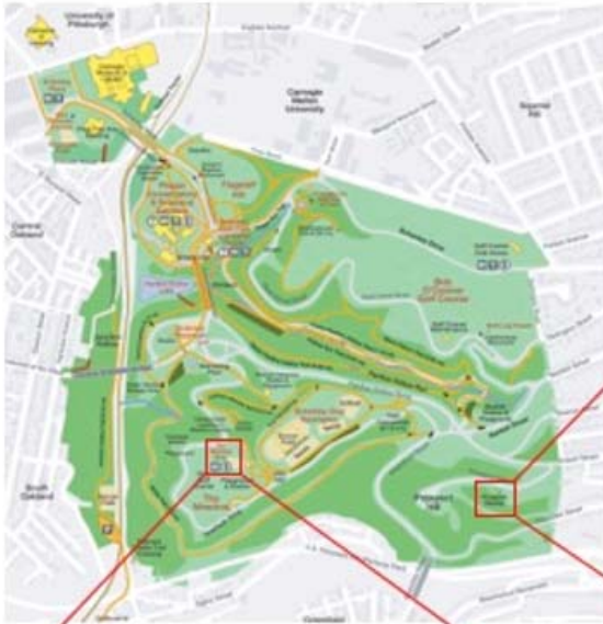
Prospect Shelter Area, Schenley Park Pittsburgh, PA Saturday and Sunday